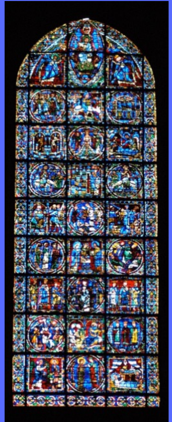
Visitation, Life of Christ Window