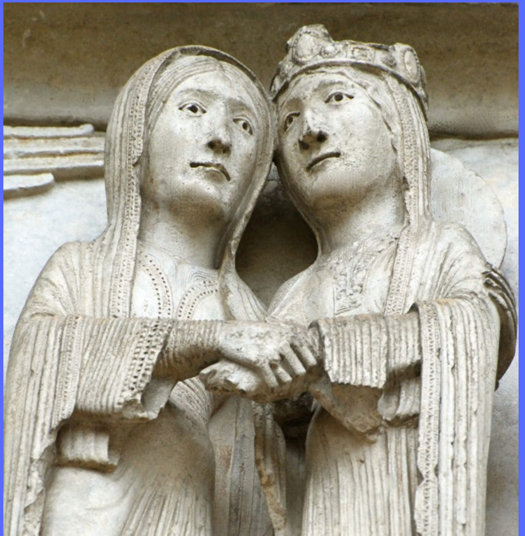
The Visitation: West Wall, Mary Tympanum (South), Chartres Cathedral

In those days Mary set out and went with haste to a Judean town in the hill country, where she entered the house of Zechariah and greeted Elizabeth.