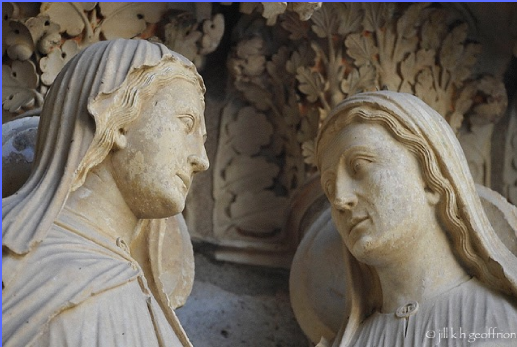
The Visitation: North Porch, East Bay, Chartres Cathedral

God's mercy is for those who fear God from generation to generation. God has shown strength with God's arm; God has scattered the proud in the thoughts of their hearts. God has brought down the powerful from their thrones, and lifted up the lowly; God has filled the hungry with good things, and sent the rich away empty.